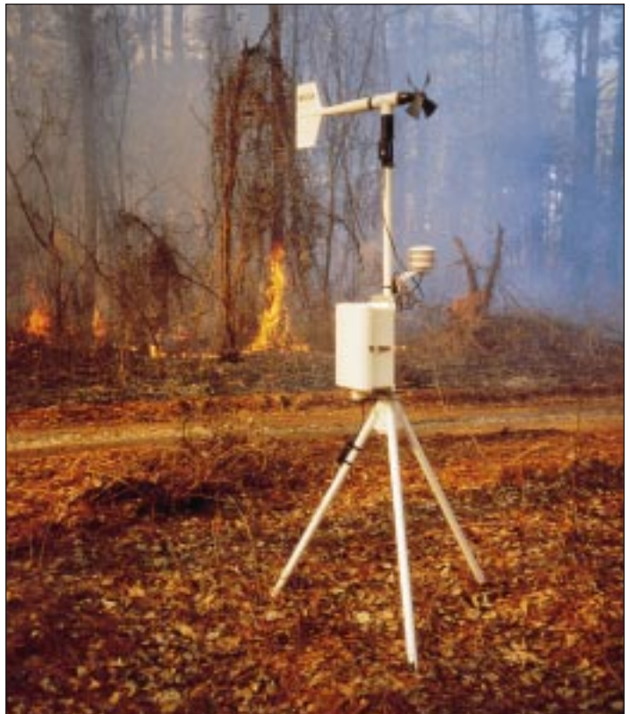
The CR510 supports many applications including the monitoring of fire conditions.

Note: The CR510 does not support multiplexers, SDM devices, or thermocouples. If you need additional channels for future use, consider a CR10X.