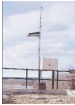
Up to 254 sites can be interrogated over a UHF or VHF frequency.

When the CR510 is disconnected from its 12 V power source, a user-replaceable internal battery retains programming and data, and powers the clock.